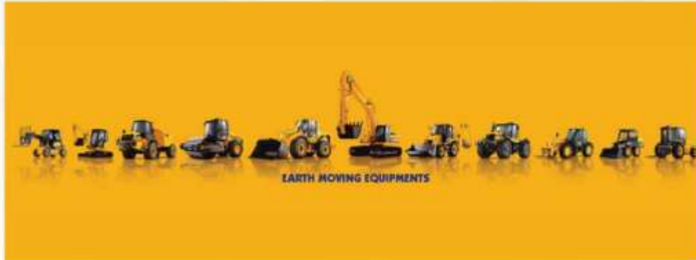
EARTH MOVING EQUIPMENTS