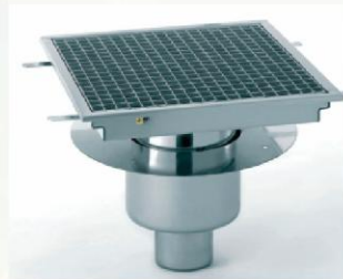
STUD BOLTS & FLOOR DRAINS