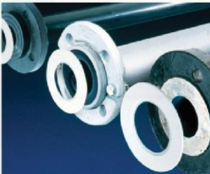
GASKETS, KITS & PACKINGS