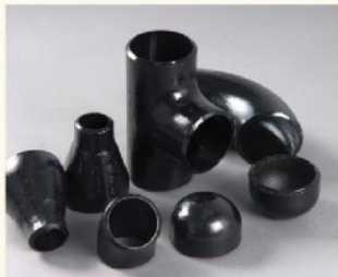
BUTT WELD FITTINGS