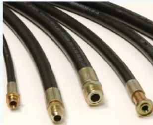
HOSES & COUPLINGS