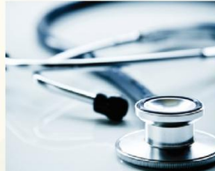
INDUSTRIAL MEDICAL SERVICES