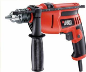
INDUSTRIAL POWER TOOLS