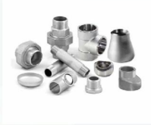
FORGED STEEL FITTINGS